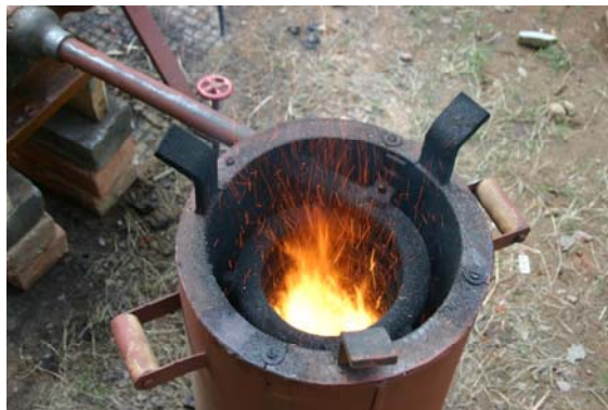
Figure 4 : Flame from the burner

The combustor is found to give a stable and good quality flame when the air-to-fuel ratio is between 2:1 to 3.5:1. Good quality flame is the one which looks transparent in some regions, indicating the carbon-monoxide and/or hydrogen component is considerable in the gaseous mixture. Figure 5 shows a flame which is somewhat transparent while figure 6 shows a more sooty flame. Flame due to sooty combustion of char and hydrocarbons are deep yellow in color. This is more polluting, and due to presence of un-burnt carbon, it also has less combustion efficiency. The combustor tested in IIT Delhi was found to give about 25% CO and about 9% H 2 at 2.3:1 air-to-fuel ratio. The air flow rate and sawdust flow rate need to be adjusted for getting a good flame.