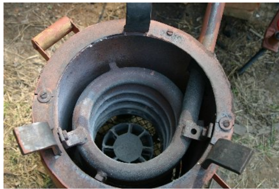
Figure 3 : The coil and the burner

Figure 3 shows the burner at the end of the coil for burning the gaseous products coming from the hot coil. The flame from the burner, in turn, keeps the coil hot. Figure 4 shows the flame from the burner.