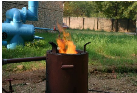
Figure 6: Sooty flame

The burner can be designed for a lower or higher power as well, in the range of about 5-50 kW. For lower power, the air flow rate should be lower and hence the coil tube diameter and length will be lower. With lower tube diameter, the coil diameter can also be smaller and the burner also of smaller size. The blower and the valves can also be of smaller size.