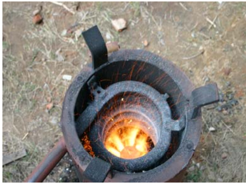
Figure 5: Flame with good transparency