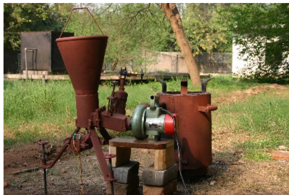
Figure 2 : The combustor developed by NERI and IITDelhi

The design of the combustor should be such that it allows limited supply of air for a desired fuel flow rate, which can allow better gasification in the coil, i.e., conversion to higher percentage of carbon-monoxide and hydrogen. The length and diameter of the coil tube have to be chosen so as to give enough residence time to the fuel for better gasification. The diameter of the coil and the burner size should be such that the flame is able to heat the coil effectively. The preferred material for the coil and outer casing of the combustor is carbon steel which can withstand high temperatures.